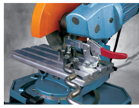
Universal Clamping Fixture