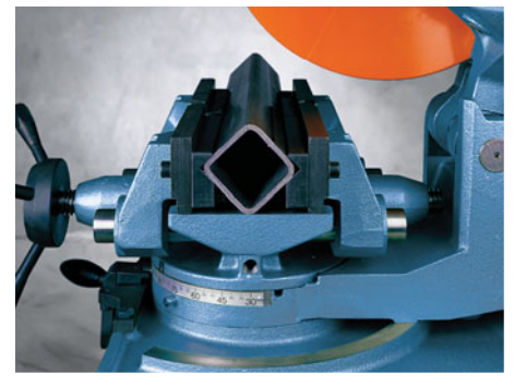
Square Tube/Diagonal Vise Jaws (Not Available on NF series)