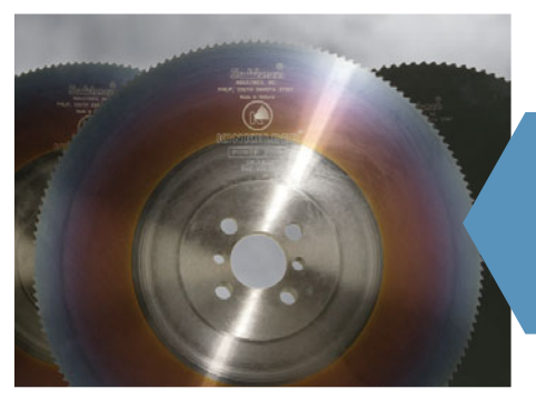
Saw Blades (See page 41)

(not available for 275 PK or 275 PKPD models)