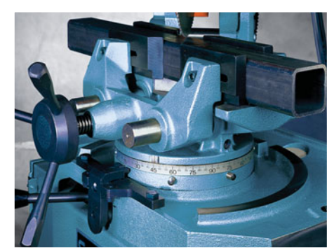
Miter Locking Device Standard Feature

Variable Speed Control (Not Available on NF or 275 series) Recommended for cutting multiple shapes, sizes, and thicknesses. RPM can be fine-tuned to achieve optimum